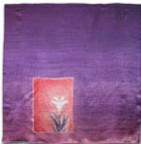
Fragrance of Flower