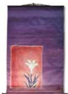
Fragrance of Flower