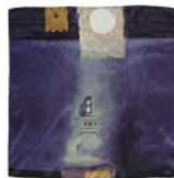
Zen Cat Golden Moment