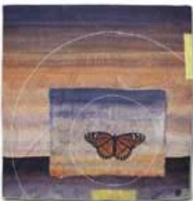
Butterfly 100% Wool

100% Georgette Silk & 100% Wool Square Scarves - 37" length x 37" wide