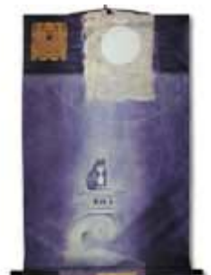
Zen Cat's Golden Moment